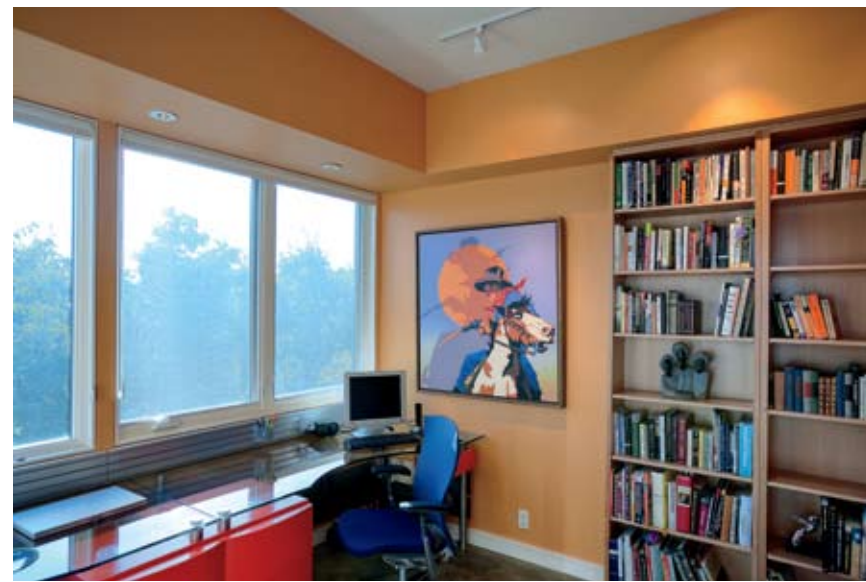
Top to bottom: A Frank McCarthy painting hangs atop a geometric Brueton console with red babinga wood and a honed black granite base. | For Richard’s office, designer Marilyn Lewis had fun with colors and created one of the few rooms where you want to look at the room instead of looking out the window. | The couple’s gallery is very open like much of the house which was designed to be virtually transparent.

Interior designer Marilyn Lewis guided the couple through color and fabric swatches and helped to blend in their existing art collection and incorporate newly acquired pieces specifically for the home. The master bedroom is a palette of calm, warm neutrals with carpet textures mimicking the flow of water. The room is accented with colors like Cobalt Blue and pieces like Carrie Ballantyne’s Steven Yellowtail , Crow Cowboy . At night, the couple can see the star-filled sky from their bed, a seamless connection of outdoor and indoor spaces.